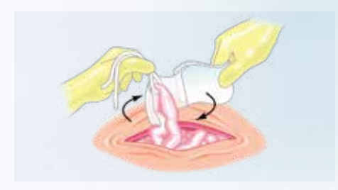
Molded to desired contour