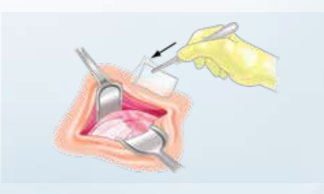
Curved or rolled